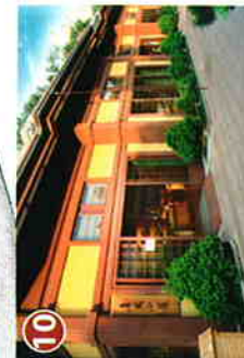
Souvenir Shop Tel: 3658 9398 Snack Shop Tel: 3658 9395