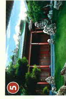
Xiang Hai Xuan Multi-purpose Hall