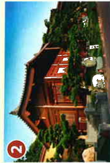
Chinese Timber Architecture Gallery