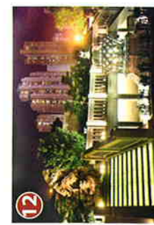
Lotus Terrace Lamp of Enlightenment