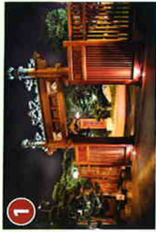
Entrance Black Lintel Gate