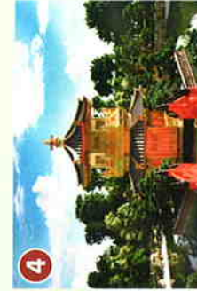
Pavilion of Absolute Perfection Lotus Pond