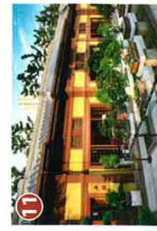
Rockery Penjing Garden