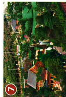
Long Men Lou The Mill Chi Lin Vegetarian Tel: 3658 9388