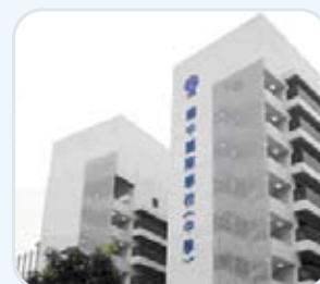
Campus of Yew Chung International School – Secondary

Workshops and presentations will be held in various classrooms and function rooms. Please refer to the Conference programme at PECERA website for detailed information.